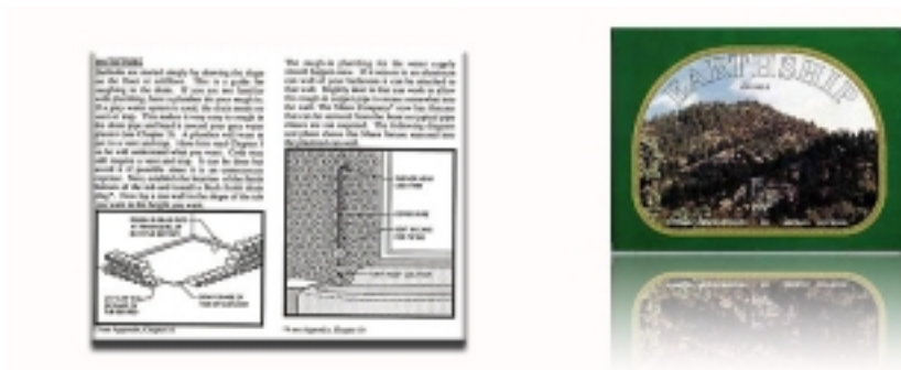
Earthship Volume II: Systems & Components $35.00

A Coming of Wizards A journey toward a state of mind from which the "Wizard Information" can be perceived. It then moves through that information and beyond the human condition. It is about finding and moving toward our potential. My hope is that o [Product Details...]