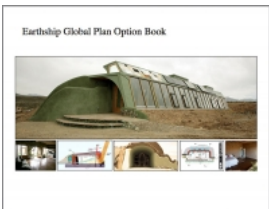
Earthship Global Plan Option Booklet $15.00

SYSTEMS & COMPONENTS first printing 1991, 254 pages Solar Electric Systems, Domestic Water Systems, Waste Water Systems and more... [Product Details...]